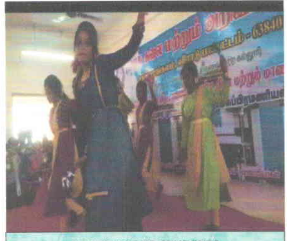
DANCE BY OUR STUDENTS