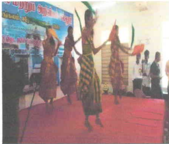
CULTURAL FEST 2022