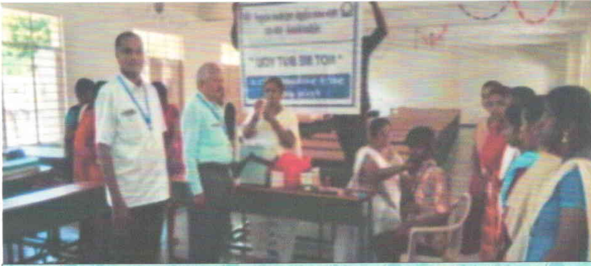
CORONA AWARENESS CAMP HELD IN GOVERNMENT ARTS AND SCIENCE COLLEGE, SATHYAMANGALAM