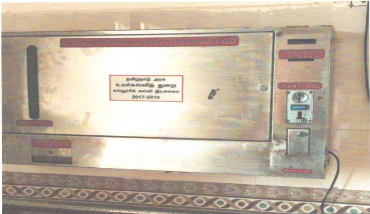
FULLY AUTOMATED NAPKIN VENDING MACHINE AT GASC, SATHYAMANGALAM