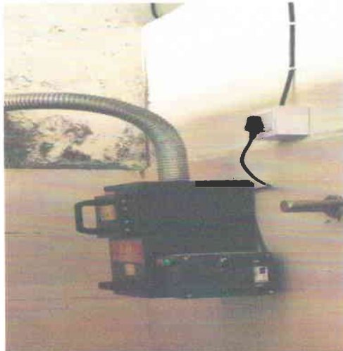
NAPKIN INCINERATOR MACHINE INSTALLED IN GIRLS RESTROOM (SECOND FLOOR)