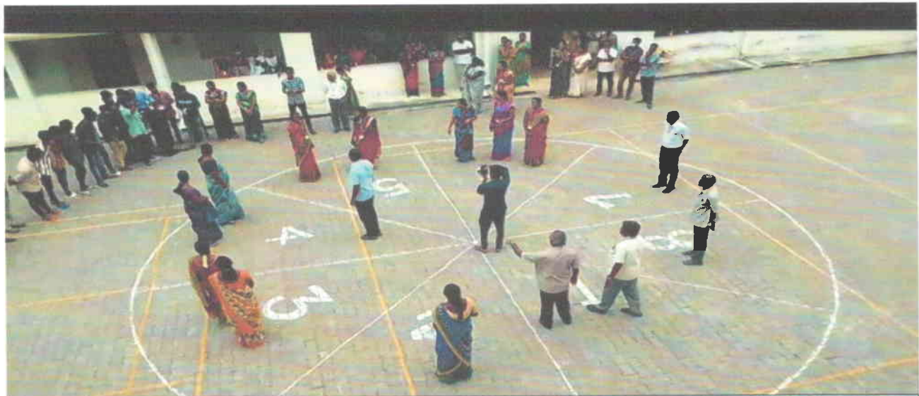
SPORTS ACTIVITY FOR OUR COLLEGE STAFFS