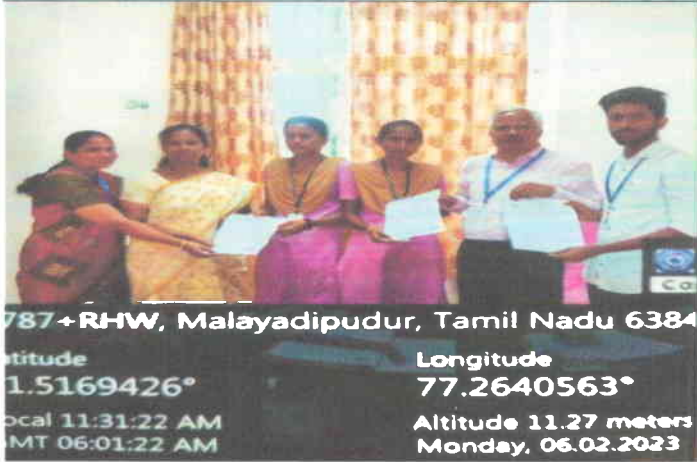
GOT CASH PRIZES FOR 1 ST MARK STUDENTS BY KAMARAJAR SCHEME