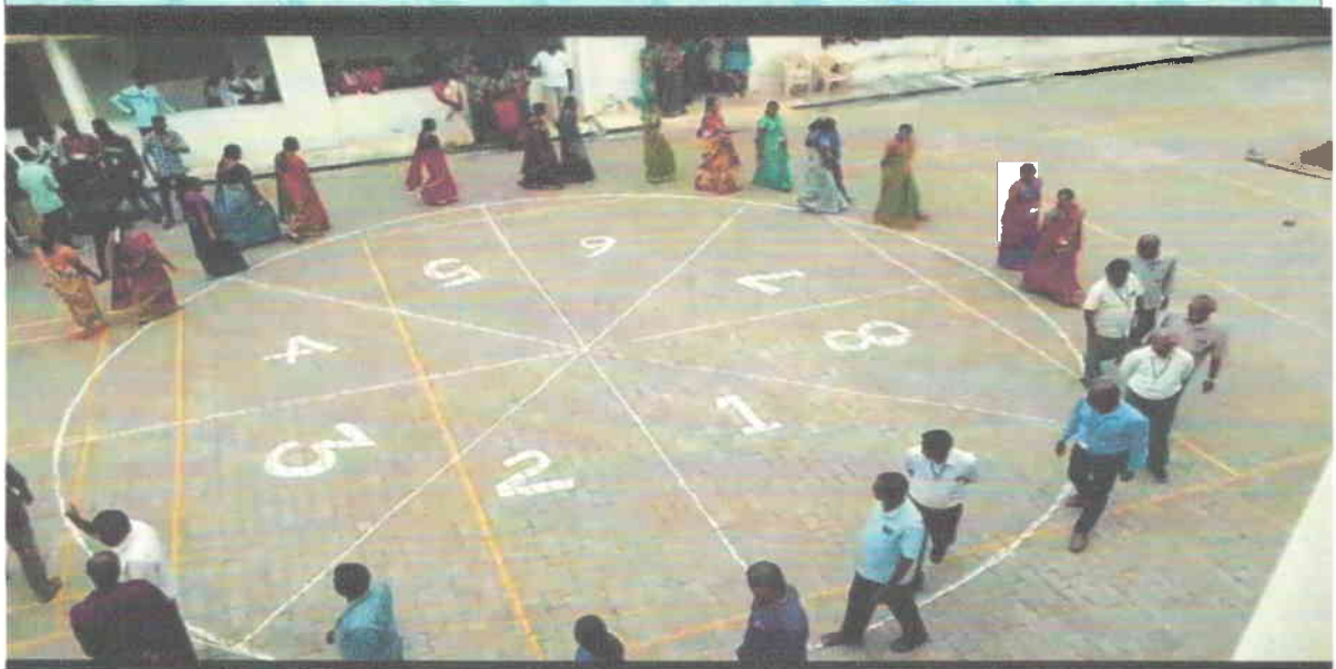
LUCKY CORNER FOR OUR STAFFS IN SPORTSDAY