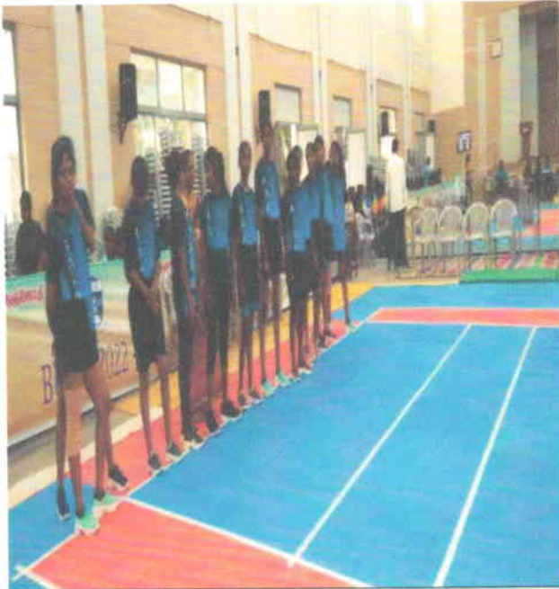
INTER COLLEGE KABBADI MEET IN NGM COLLEGE STADIUM, POLLACHI